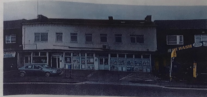
SHOP FRONT - 53 YARM LANE